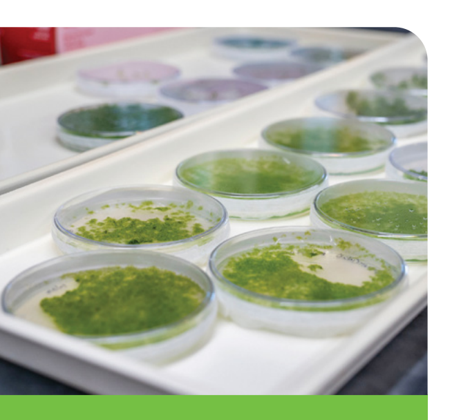
Moss in the lab. Despite their importance in climate change mitigation, mosses are poorly understood, especially their response to elevated CO_2 .